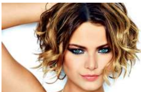
THIS SUMMER'S TRENDIEST SHORT HAIRCUTS. GET INSPIRED!