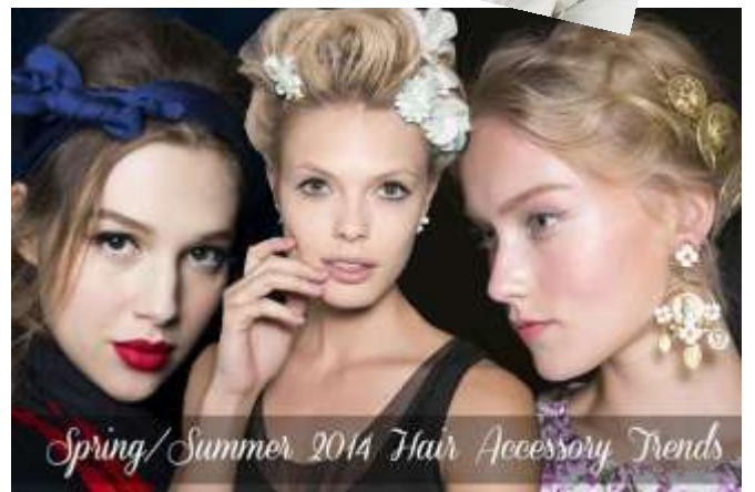
Spring/Summer 2014 Hair Accessory Trends